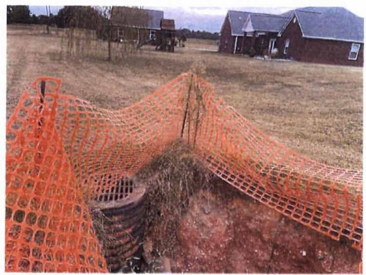
Pipe failure location looking towards 132 Bermuda Ln