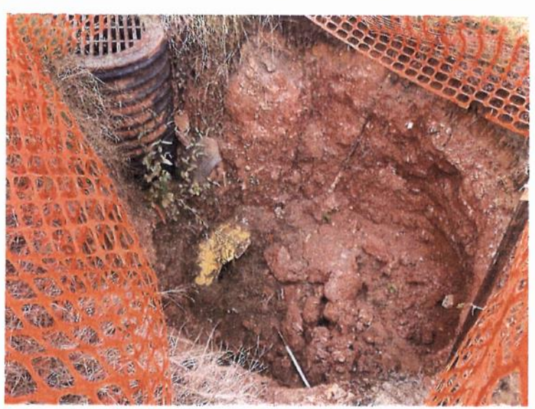
View inside hole caused by pipe failure

Based on video footage of this line, there is a bend in the pipe to the right of the pictures. There is no junction box at this bend and the pipe changes from reinforced concrete (RCP) to high density polyethylene (HDPE). The HDPE pipe (plastic pipe) appears to be crushed between the bend and the existing inlet shown in the left side of the pictures.