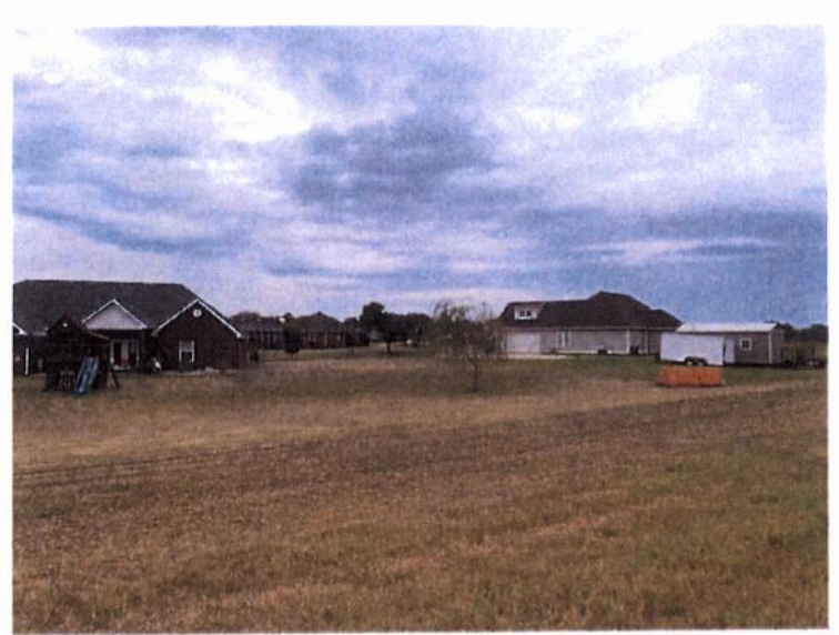
View of rear of 132 Bermuda Ln.

Upon inspecting the site, the "sink hole" turned out to be a failed stormwater pipe. The pipe failure and subsequent erosion had left a large hole in the south east corner of 132 Bermuda Ln. As seen in the pictures below, this large hole is in close proximity to a child's playset.